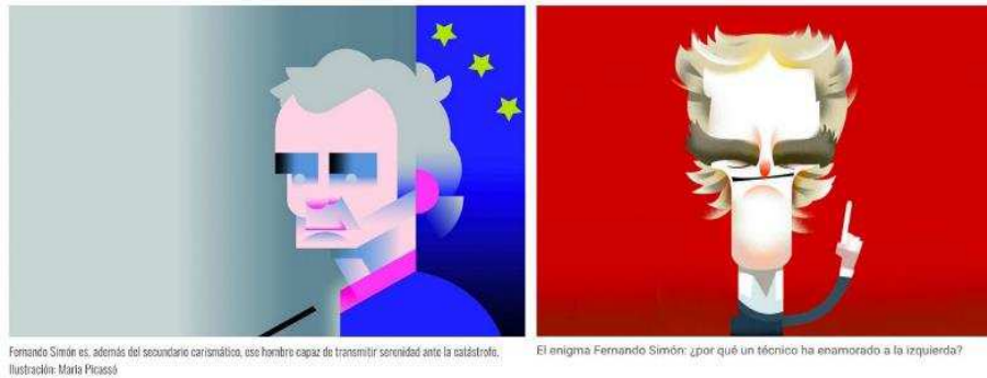
Image 2: Illustrations of Fernando Simón published in El País ( https://links.uv.es/AMd38G1 ) and in El Confidencial ( https://links.uv.es/1VPK1fh ).